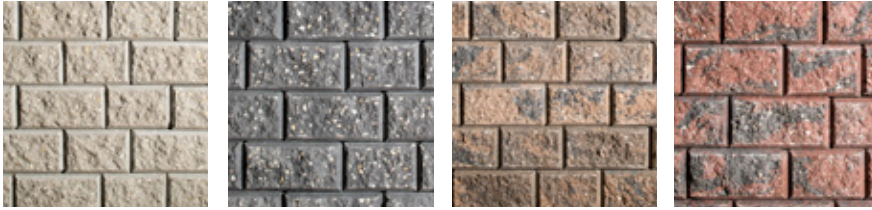
Grey Charcoal Rustic Northern Blend