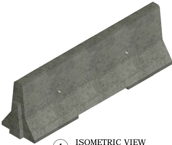
1 ISOMETRIC VIEW Scale - 1:30