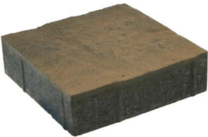
River Rock 2 290 mm x 290 mm x 80 mm 11.4" x 11.4" x 3.1"