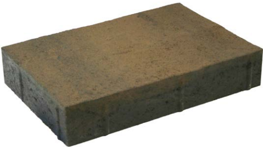
River Rock 3 290 mm x 435 mm x 80 mm 11.4" x 17.1" x 3.1"