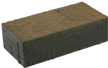
River Rock 1 145 mm x 290 mm x 80 mm 5.7" x 11.4" x 3.1"